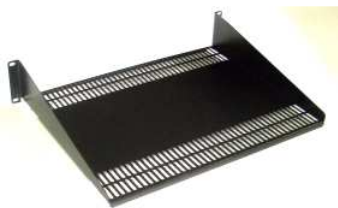
Front mounted shelf